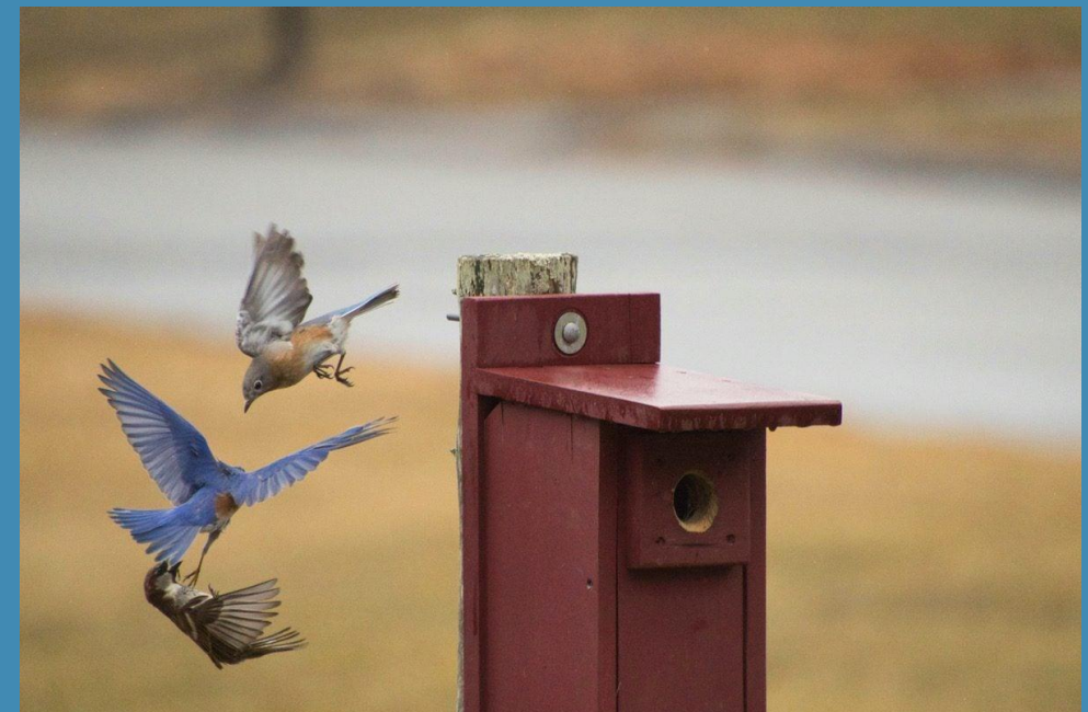
Kaufman, K. and K. (2023, March 15). How to keep sparrows out of bluebird houses. Birds and Blooms. https://www.birdsandblooms.com/birding/attracting-birds/bird-nesting/keeping-house-sparrows-bluebird-boxes/